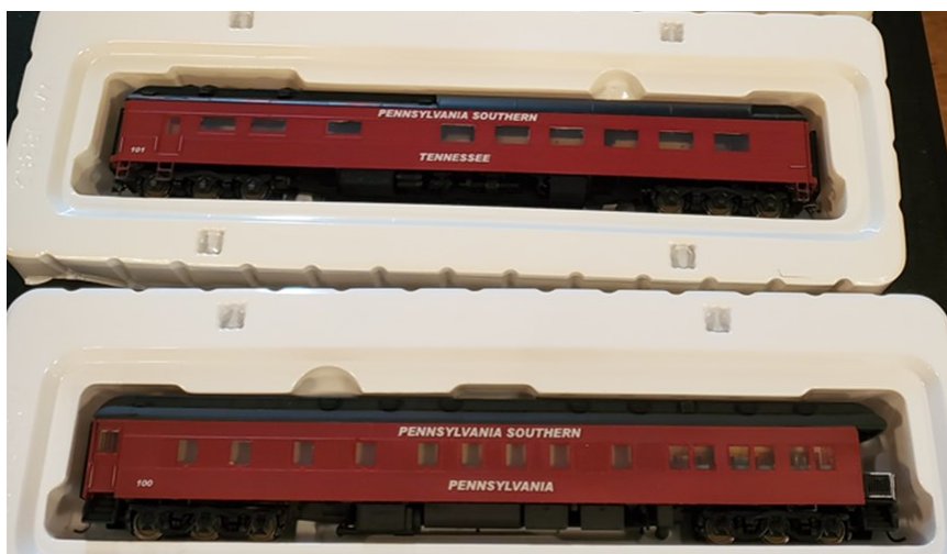
Bob Weinheimer's 5 car executive train, cropped to two cars to save space.